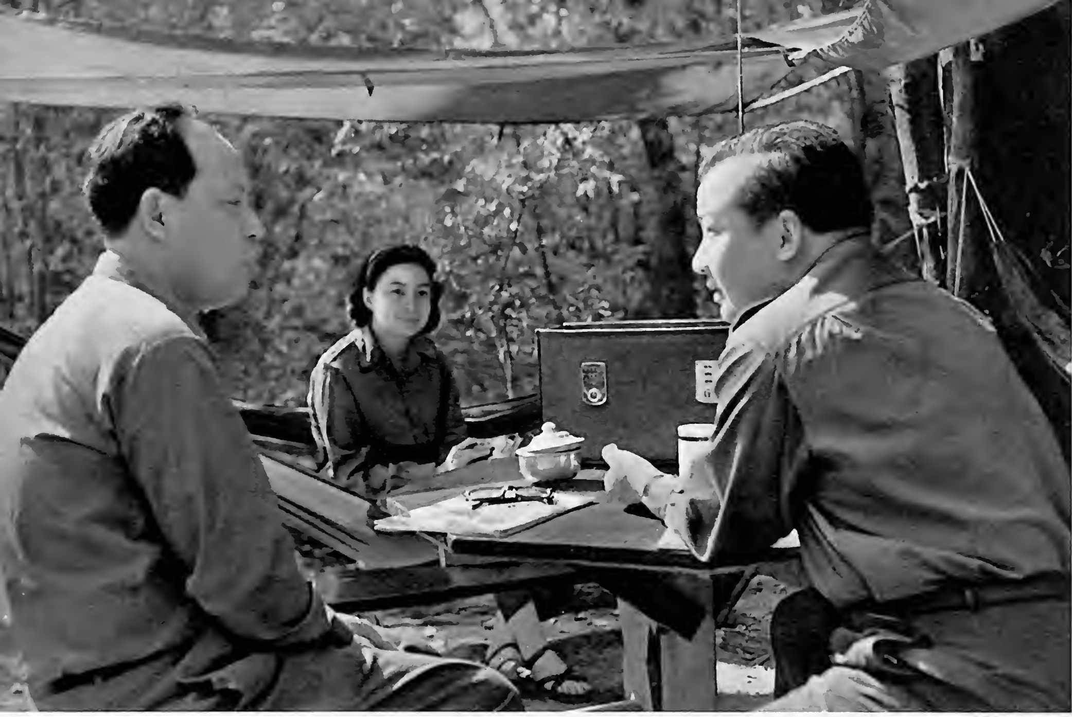
Samdech and Madame Sihanouk chatting with Ieng Sary, special envoy from the interior of Cambodia, while resting in the forest.